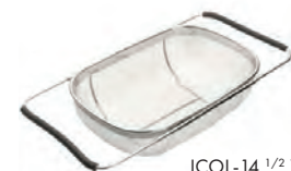
JCOL-14 1/2 X 22 1/2