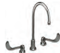
J-1174 Series J-1176 Series