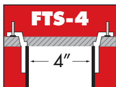
4" Toilet Flange with 4" Drain Pipe