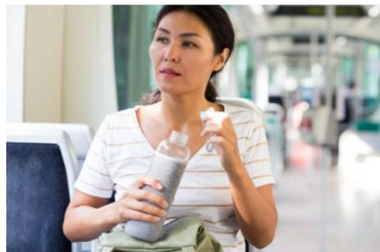
On The Go